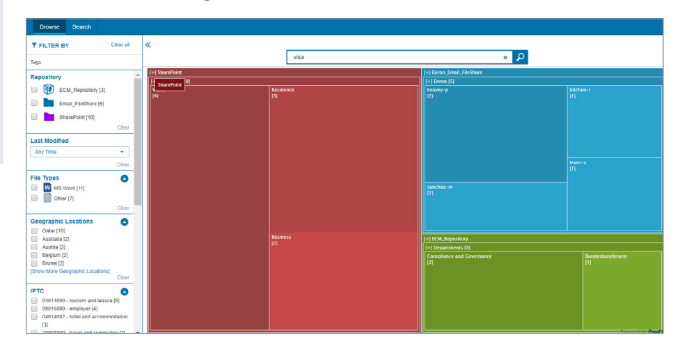
Straightforward browsing experience to explore repositories with ease.

Organizations already leveraging the Magellan pipeline and crawlers can quickly take advantage of the offering, since it will plug into an existing stack with minimal installation and configuration. By default, Magellan comes with the MTM pipeline and crawlers.