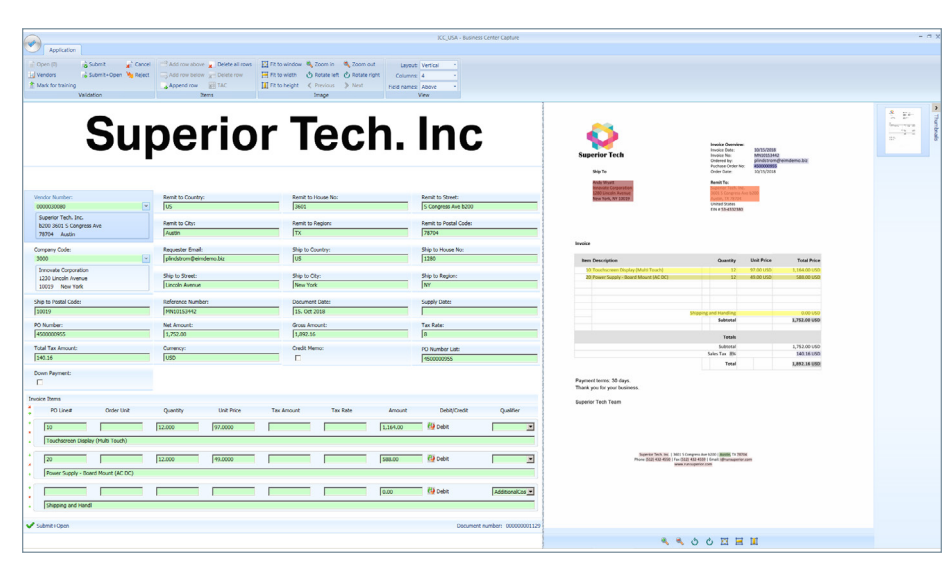
Metadata extracted from a scanned document by Intelligent Capture

OpenText Vendor Invoice Management for SAP Solutions »